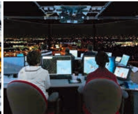
Air Traffic Control Optimum Training Solution (ATCOTS)