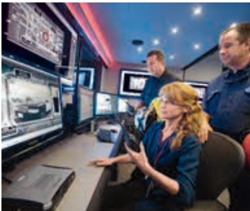
Civil Communications Solutions

Technical Services, with 2009 sales of $3.2 billion, provides technical, scientific and professional services for defense, federal and commercial customers worldwide. Key programs include the Federal Aviation Administration's Air Traffic Control Optimum Training Solution (ATCOTS) contract, which maintains and improves controller training, and the U.S. Army's Warfighter Field Operations Customer Support (FOCUS) activities, which train warfighters in 500 locations worldwide.