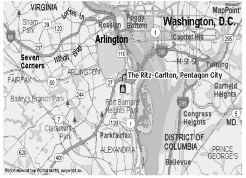
(Note: Valet parking is available for a fee at the hotel.)

From Route 50 West/ Fairfax , Follow Route 50 East to Route 27 East/ Washington Boulevard (towards I-395/ Pentagon). Merge onto Washington Boulevard and take I-395 North ramp towards Route 1 South. Stay right at the first fork and left at the second fork. Merge onto South Hayes Street. The Ritz-Carlton will be on the right, adjacent to Nordstrom.